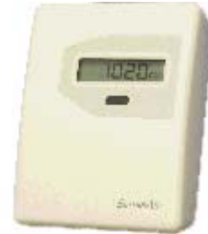
eSENSE®-D IP20 wall housing with display