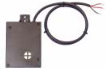
eSENSE-IP50 0.6/2/4/10% option

Note 1: The SO 2 enriched environments are excluded.