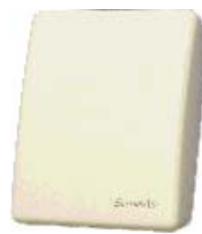
eSENSE® IP20 wall housing without display

eSENSE® helps you save money by decreasing your energy consumption while creating a healthier indoor climate!